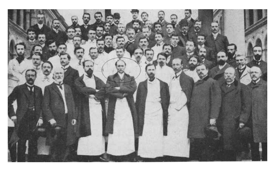
Figure 3 The department of Professor Dieulafoy in Hôtel-Dieu Hospital, Paris, 1903.

Dieulafoy has been recognized as an innovative investigator