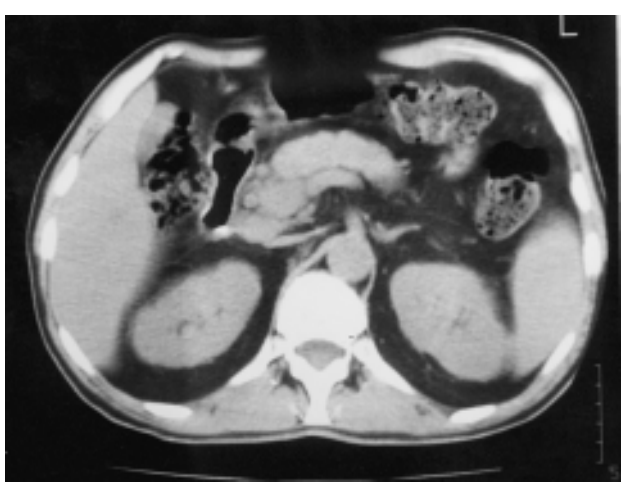
Figure 2. CT scan revealing enlargement and anomogeneity of the head of the pancreas.