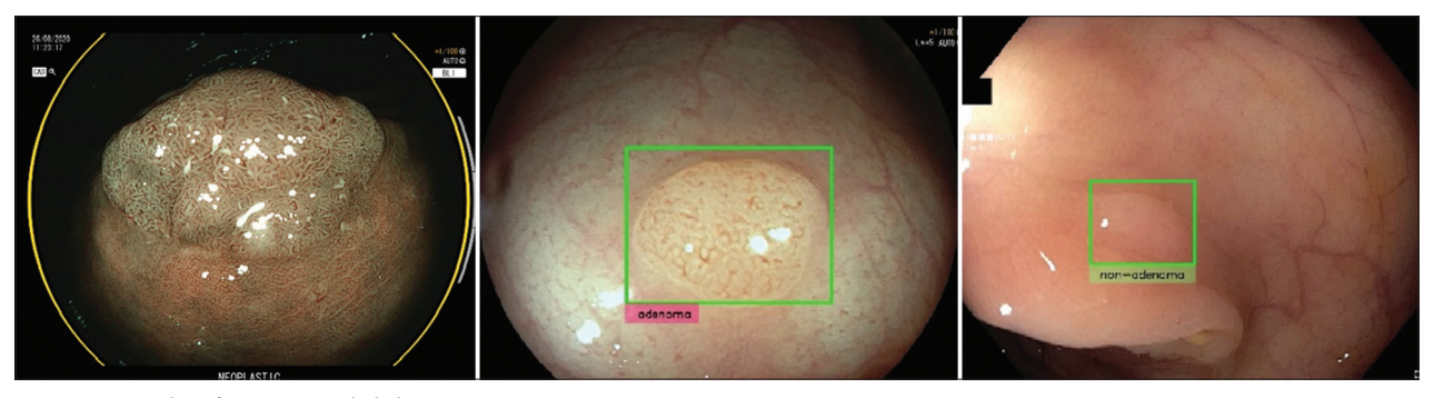
Figure 2 Examples of computer-aided characterization

For all the above-mentioned reasons, optical diagnosis of diminutive polyps is the natural territory where the availability of a reliable AI system for CADx can be a game changer in clinical practice. All the stakeholders involved in colonoscopy