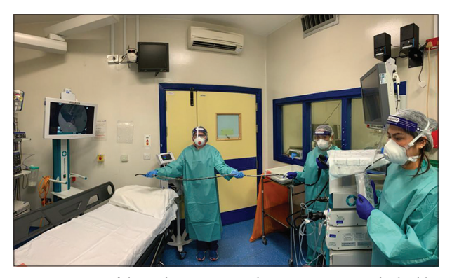
Figure 4 Setup of the endoscopy room during an anterograde doubleballoon enteroscopy at the Royal Free Hospital in London

recuperate the endoscopic activity canceled during the delay and the lockdown phases ranges from 103-155, depending on the PPE policy/perceived COVID-19 transmission risk, as described by Gupta et al [24]. We are also very likely to see a "domino