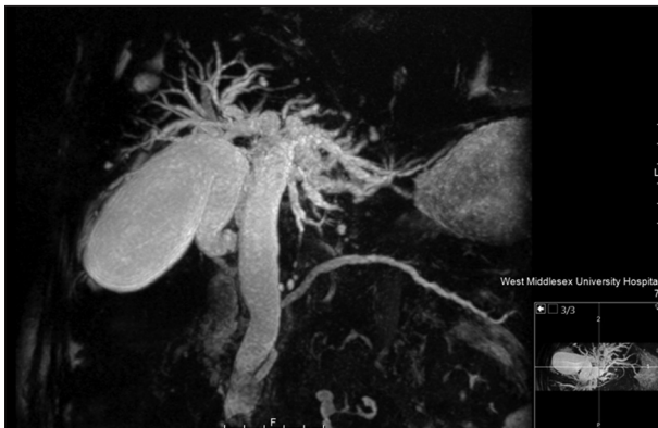
Figure 2 MRCP: a 77-year-old male presented with clinical jaundice and symptoms and biochemical analysis consistent with gallstone pancreatitis (bilirubin 69 \mu\text{mol/L} , ALP 486 IU/L). An initial ultrasound scan of his abdomen demonstrated a non-dilated CBD and no sonographic evidence of a calculus. Subsequent MRCP measured a 1.8 cm CBD containing multiple calculi. During the ERCP examination an 8 mm stone was removed with a balloon, sphincterotomy was performed and a CBD stent inserted. Subsequently, the patient had a laparoscopic cholecystectomy and removal of the CBD stent within 8 weeks of initial presentation MRCP, magnetic resonance cholangiopancreatography; ALP, alkaline phosphatase; CBD, common bile duct; ERCP, endoscopic retrograde cholangiopancreatography

radiologists. Of the 69 cases excluded, 22 were due to difficulty visualizing the biliary tree on index imaging.