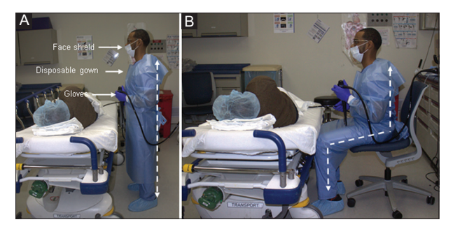
Figure 3 Gastroenterologist wearing protective personal equipment while standing (A) or sitting (B) during endoscopic procedures

In addition, ensuring breaks during multiple procedures to allow for recovery of muscle fatigue is also an important way of preventing overuse injuries [37]. Cushioned mats and insoles have been suggested to improve endoscopist's comfort during long hours of standing while performing procedures [31]. Accidental falls over exposed wires may be prevented by bundling wires, running wires from ceiling outlets or covering them on the floor with non-slip mats [35]. Additionally, the use of wireless medical devices can decrease the risk of tripping over wires in the endoscopy unit [40].