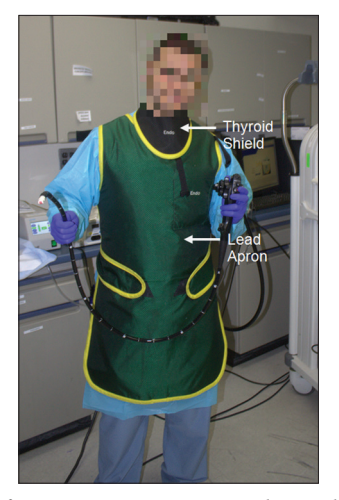
Figure 4 Use of protective equipment to reduce radiation exposure using thyroid shield, lead body apron, and radioprotective eyeglasses (not shown here)

Other factors that can affect radiation dose include the type of X-ray tube used (over-couch C-arm units vs. undercouch units), mobile vs. stationary X-rays and the total time spent in fluoroscopy during the procedure (a collinear