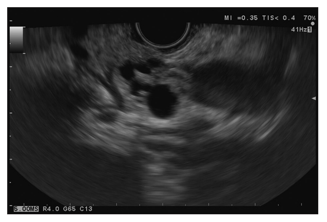
Figure 2 Fifteen mm cyst in the uncinate process. Communication with the pancreatic duct, typical of branch-duct intraductal papillary mucinous neoplasm, is observed