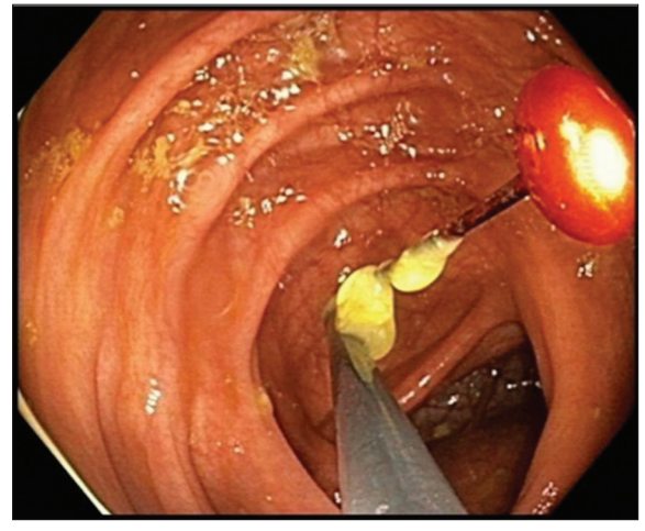
Figure 2 Extraction of the foreign body from the cecum using endoscopic forceps to grasp the sharp pin tip

factors in adult populations include developmental delay, alcohol intoxication, psychiatric illness and incarceration [5]. Even in the absence of radiographic evidence, an endoscopic study is still advised and should be performed on an urgent or emergent basis [4].