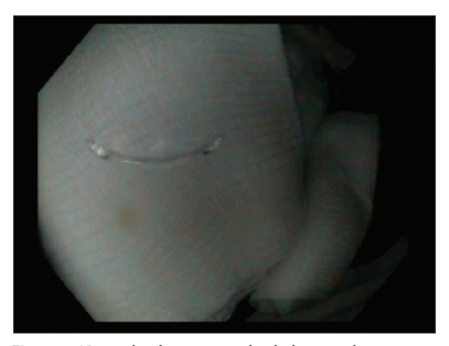
Figure 4 Narrow-band imaging utilized during colonoscopy to improve the visualization of the glass object in the mid-ascending