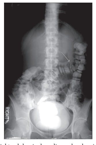
Figure 3 Upright abdominal radiograph showing a proximal 3.4-cm linear opaque density (arrow) overlying the left abdomen with nonspecific bowel gas pattern. Visualization of objects of certain composition, such as the glass pictured here, requires astute observation and clinical correlation

Conventional practice advocates for surgical intervention if the object has not passed after 3-4 days [4,7]. A retrospective series found that surgery was required in 4.8% of 542 cases,