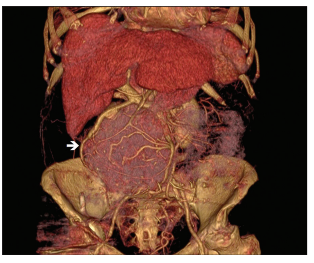
Figure 1 A 15-cm mass of the pancreatic head (white arrow)

DOI: http://dx.doi.org/10.20524/aog.2016.0068