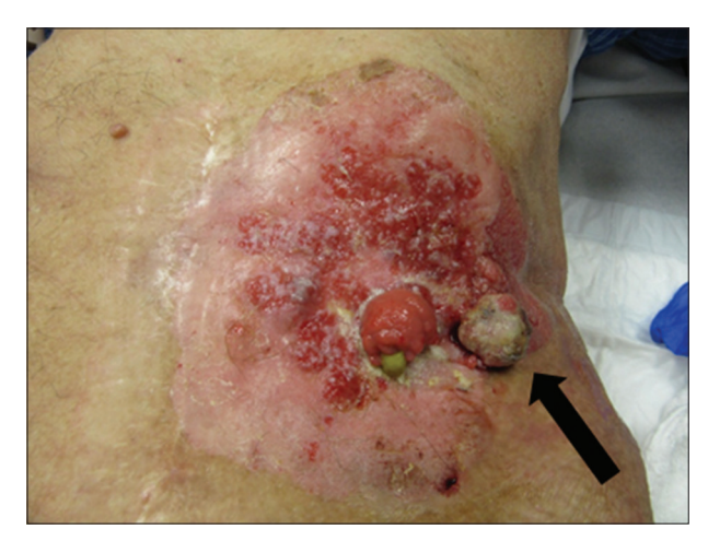
Figure 3 Adenocarcinoma of intestinal origin adjacent to endileostomy. An 80-year-old male diagnosed with Crohn's disease for more than 50 years, and for which an end-ileostomy for 14 years presented an exophytic lesion at the left side of the ileostomy (arrow). Biopsy of the lesion showed adenocarcinoma of intestinal origin

The landmark prospective CESAME study assessed the risk of LD in IBD patients [44]. It was observed that the risk of LD was five times higher in patients exposed to thiopurines than in those never exposed to these drugs. Age >65 years, male sex, and longer duration of IBD were also associated with increased risk of incident LD. The reason for the excess risk of LD in IBD patients receiving thiopurines is not well known