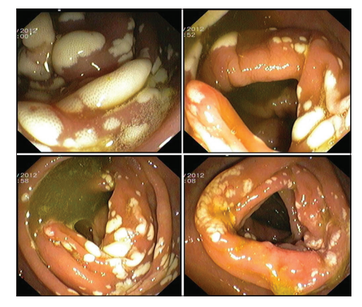
Figure 1 Endoscopic appearance of colonic pseudolipomatosis: whitish plaques, some confluent, interspersed with normal mucosa at the ascending colon

Conservative management is adequate since the lesions regress spontaneously without complications within weeks.