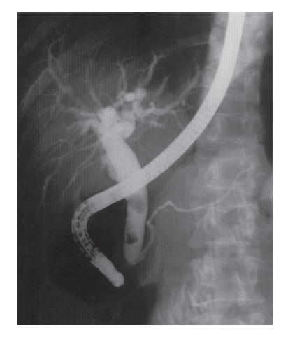
Figure 2 Cannulation of upper and lower papilla demonstrates choledocholithiasis and a normal pancreatogram, respectively

Department of Endoscopy and Motility Unit, G. Gennimatas General Hospital, Aristotle University of Thessaloniki, Thessaloniki, Greece