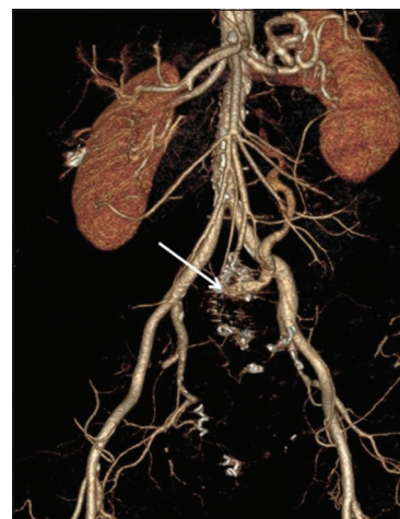
Figure 3 Three-dimensional volume rendering analysis from computed tomography angiography after the second embolization, showing the previous embolization sites without further fistula perfusion and a small arteriovenous malformation between the inferior mesenteric artery and vein (white arrow)