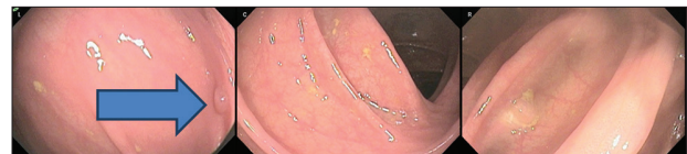
Figure 2 Example of potentially omitted adenoma on left screen

preparation. If the operator considered the preparation to be poor (BBPS<7), the patient was not included. Patients underwent conscious sedation with propofol or general anesthesia with oral intubation. All procedures were performed with a Fuse® adult standard video-colonoscopy (168 cm working length, 12.8 mm scope outer diameter, 3.8 mm working channel). CO 2 insufflation was used. Colonoscopies were performed by 6 senior operators and 5 fellows under direct supervision. Colonic polyps were resected during the procedure if necessary. Polyps were removed if they were identified as other than diminutive (1-2 mm) rectal polyps thought to be hyperplastic in nature. The removal techniques included polypectomy with diathermic forceps or cold snare, and endoscopic mucosal resection.