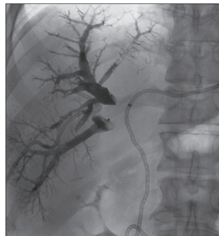
Figure 2 Fluoroscopic picture showing contrast cast after embolization of the right portal vein branches. A right external and a left internal-external drain is also placed prior to surgical resection of the right liver lobe

particles or histoacryl glue [8] (Fig. 2). PVE and drainage may be performed in a sequential approach as a two-stage procedure or as recently published study by Guiu et al [9] during the same session.