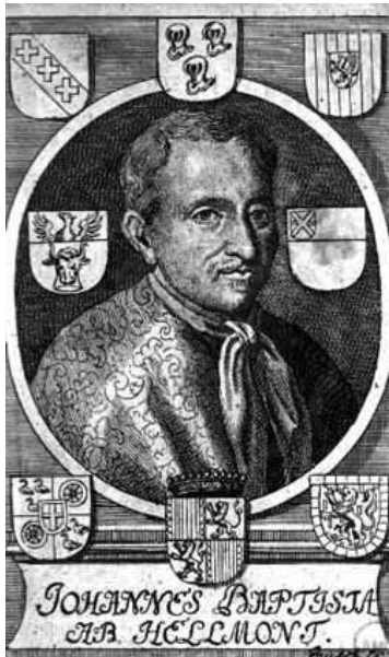
Figure 1 Jean Baptiste van Helmont (1759-1644)